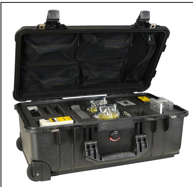
Figure 2. Desco Europe 222689 ESD Survey Kit