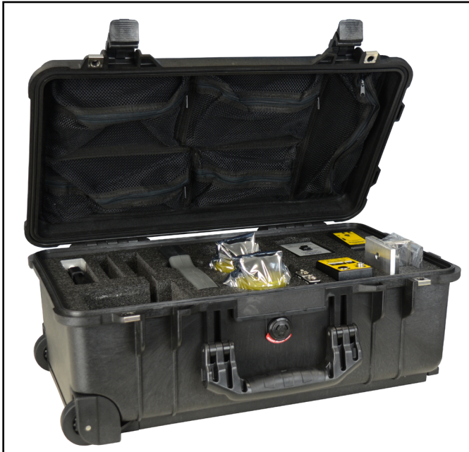
Figure 1. Desco Europe 222688 ESD Survey Kit