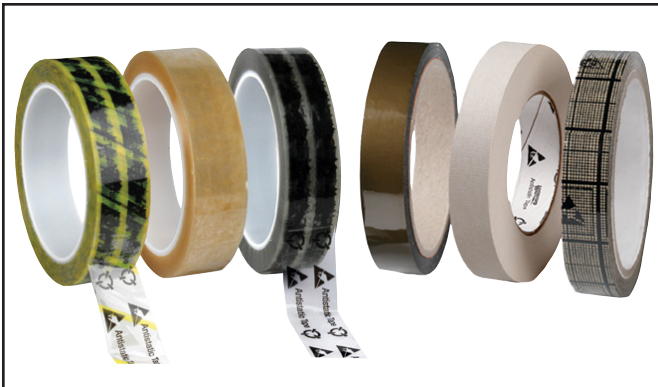
Wescorp ESD Tapes

In ESD protected areas, replace regular high charging tape with Wescorp ESD Tape. ANSI/ESD S20.20 section 8.3.1. states "All nonessential insulators, such as those made of plastics and paper (e.g., coffee cups, food wrappers and personal items) must be removed from the workstation."