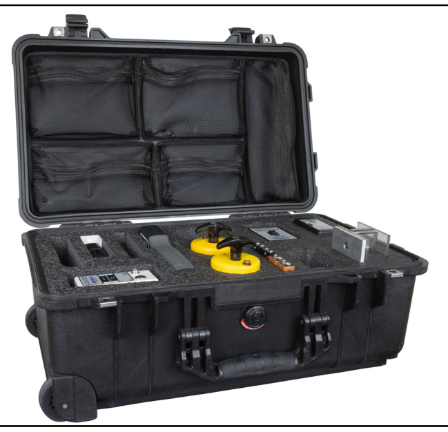
Figure 2. Desco Europe 222698 ESD Survey Kit, Europe