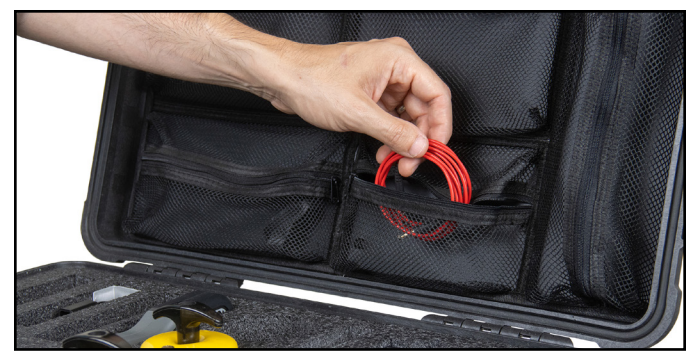
Figure 3. Using the ESD Survey Kit's lid organizer

The ESD Standard IEC 61340-5-1 can be purchased from <u>www.bsigroup.com</u>.