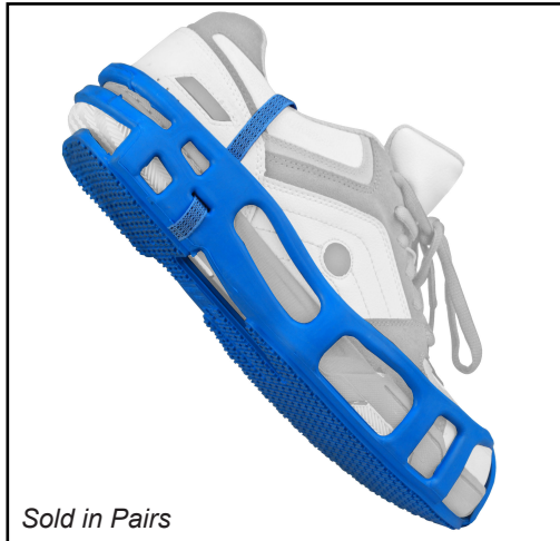
Sold in Pairs