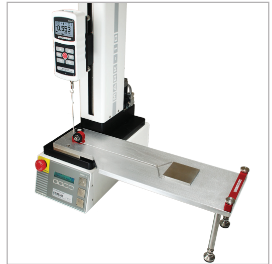
Shown with an ESM301 test stand and G1086 COF fixture

The M5-2-COF may also be used for a number of common tension and compression testing applications. The gauge is based on Mark-10's Series 5 advanced digital force gauges, and includes the series' full set of functions and settings.